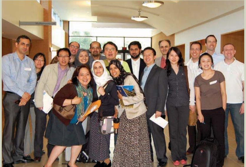
Pathology Residents and other participants at Pathology Day

There were two concurrent oral sessions this year so twice as many abstracts selected for oral presentations by residents, graduate students and post-doctoral fellows. Several awards will be given to best oral and poster presenters.